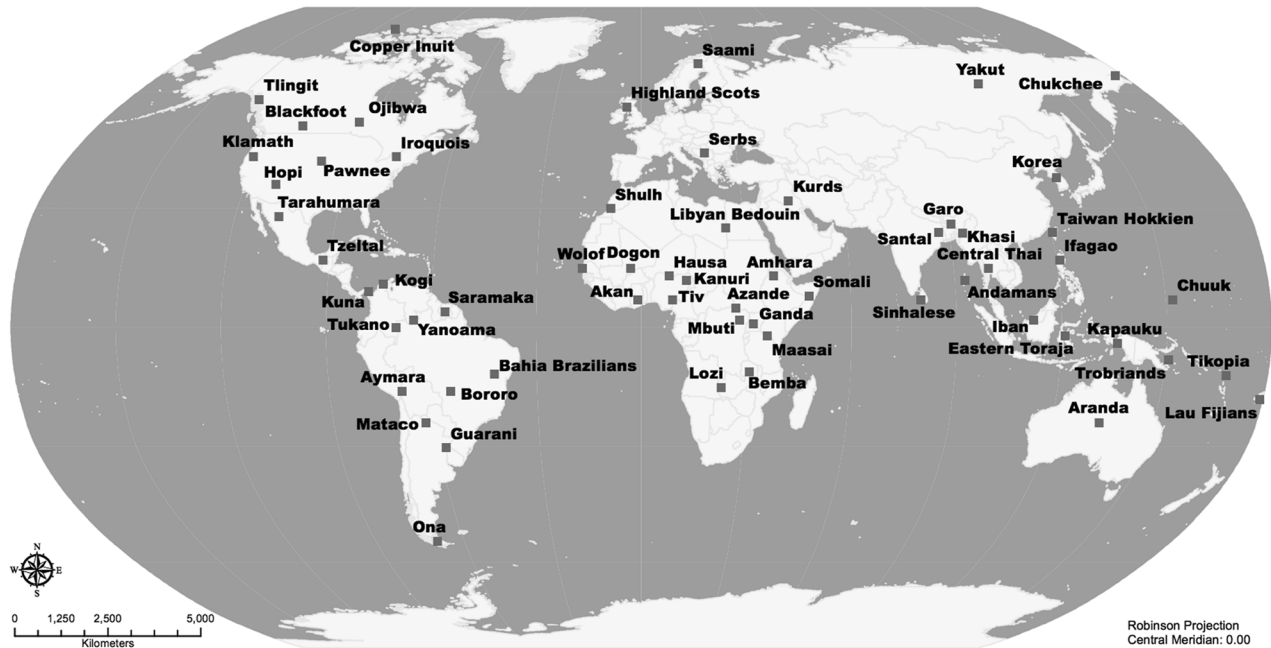
Figure 1. Locations of 60 Probability Sample Files Societies.

ative behaviors had a positive or negative moral valence. 8 Raters 1 and 2 (authors O.S.C. and D.A.M.) independently coded the full set of 3,460 paragraphs and then conferred to resolve ambiguities and discrepancies. This resulted in a total of 1,426 paragraphs that contained material germane to one or more moral domain. A hypothesis-blind independent coder (rater 3) then coded each of these 1,426 paragraphs before discussing coding discrepancies with raters 1 and 2. Of the 1,426 \times 7 = 9,982 initial coding decisions compared between the two sets of codes, there were 8,704 decisions in agreement and 1,278 decisions on which the raters disagreed—thus there was “moderate” agreement between the two initial sets of ratings overall ( \kappa = .58, P < .005 ) (Cohen 1960, 1968; Landis and Koch 1977). By type of cooperation, the degree of agreement between the two sets of ratings were: “helping kin” ( \kappa = 0.52 ; “moderate”); “helping your group” ( \kappa = 0.47 ; “moderate”);